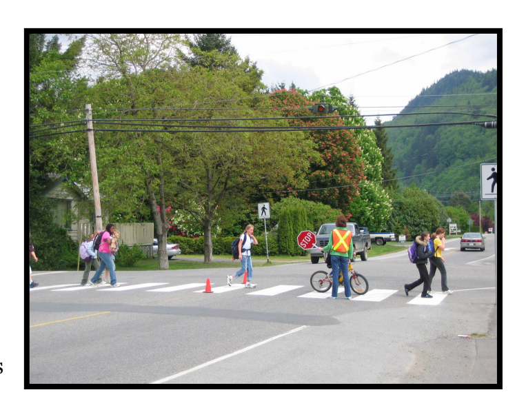
Crossing guards at Yarrow Elementary help students cross Yarrow Central Rd. safely.