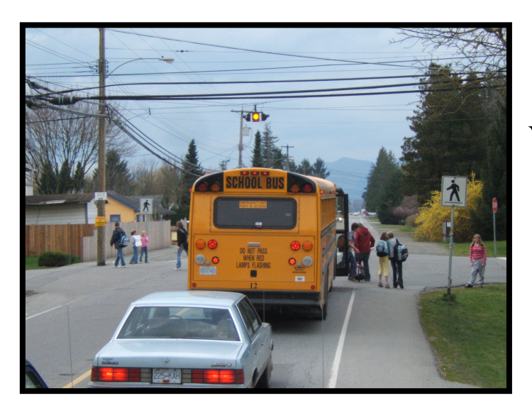
Students are dropped off at the corner of Yarrow Central Rd. and Wilson Rd.